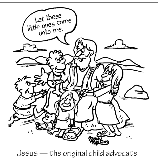
Jesus — the original child advocate

"Not only does abortion kill unborn children; it destroys constitutional order and the common good, which is assured only when the life of every human being is legally protected" ~ Cardinal Francis George